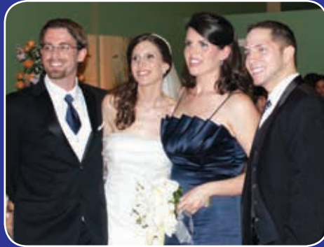
2009...celebrating his wedding day