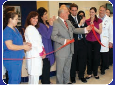
2010...grand opening of Cano Health

through the provision of high-quality health care. Not surprisingly, he credits the triple-pronged academic approach he pursued at NSU for making him the well-rounded professional he is today.