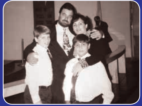
South Florida 1996...family photo