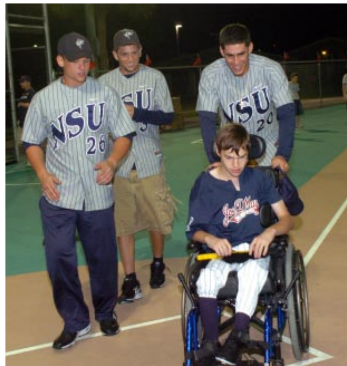
Members of Sharks baseball team assist a member of the Miracle League around the bases.