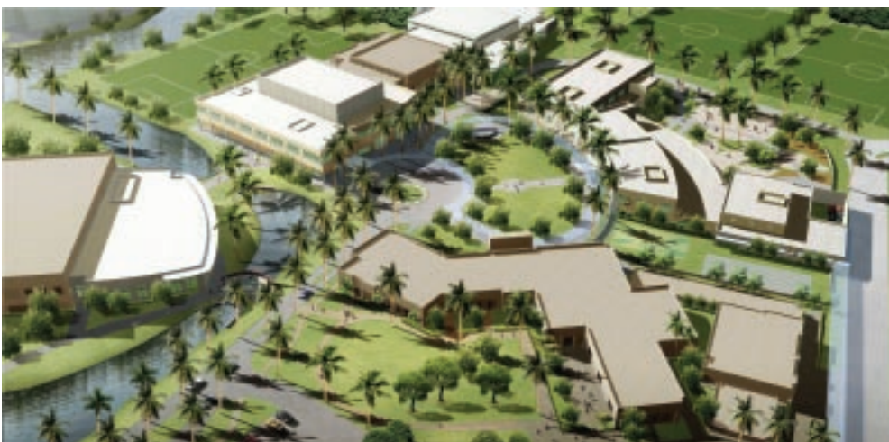
Rendering of University School campus with all buildings completed

The University School project is approximately 227,000 square feet of new construction and 91,500 square feet of renovated space and consists of seven major components. A modern cul-de-sac, surrounded by an island of landscaping architecture, the ellipse formation of each facility will be connected by covered walkways, providing students and faculty members with shelter from the elements. This outdoor site may be used for events and large gatherings.