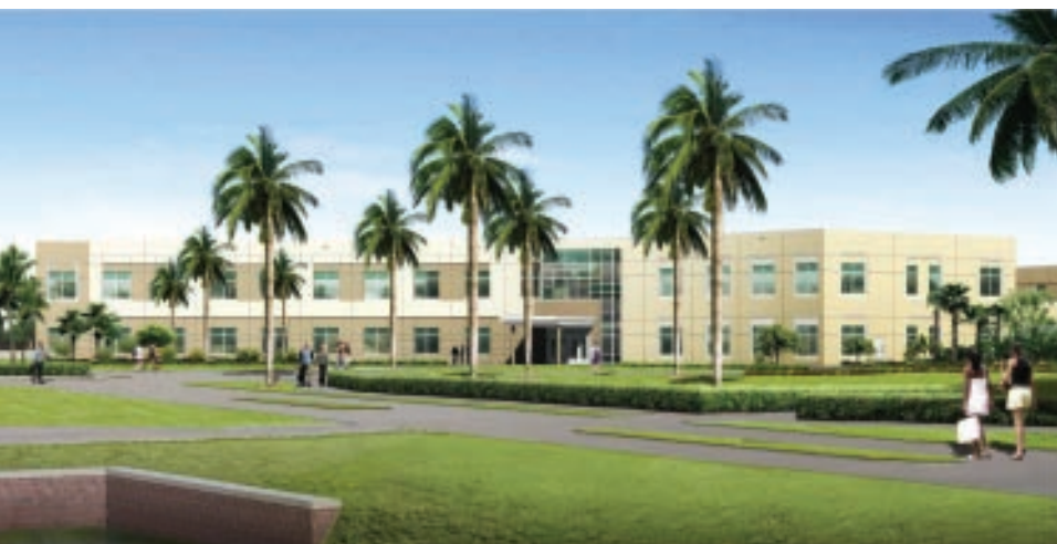
TOP: The new Fine and Performing Arts building BOTTOM: Rendering of completed University School Lower School