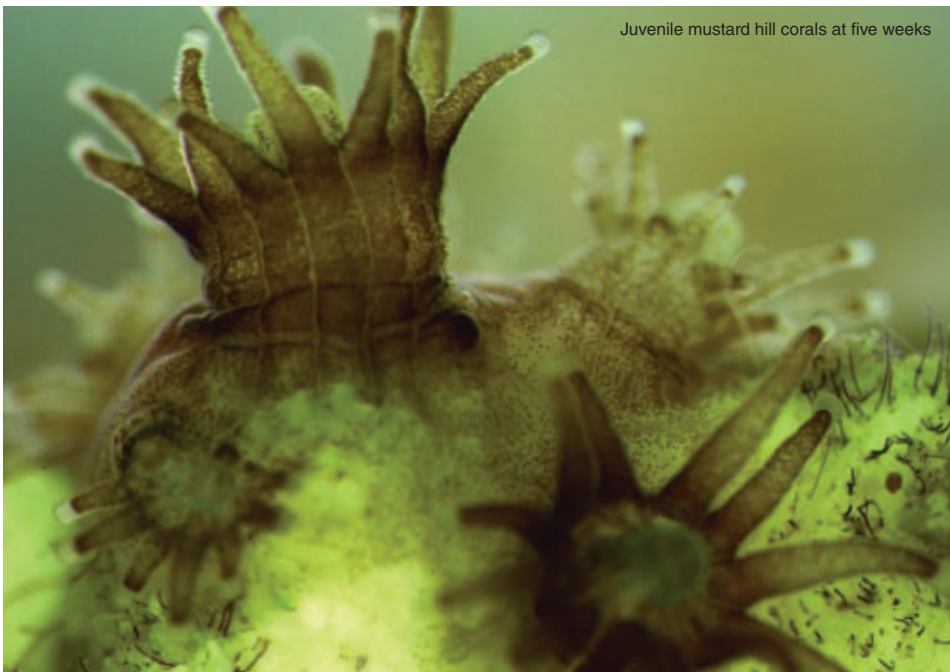
Juvenile mustard hill corals at five weeks

Drawing millions of visitors each year, Florida’s clear waters, pristine beaches, and coral reefs support a $53 billion tourism industry and a $14 billion marine industry. Recognizing the importance of healthy coastal habitats, NSU’s National Coral Reef Institute and the state of Florida have taken important steps to strengthen protection for coral reefs during the last five years. ■