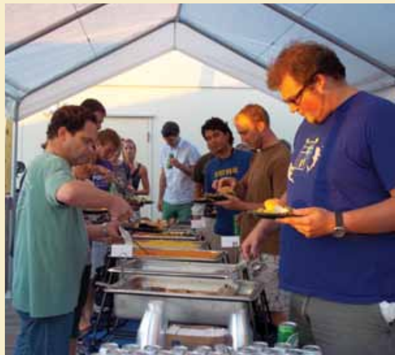
Students enjoying a buffet on the deck after the Distinguished Researcher Seminar Series

of animal phyla—in sequence, expression, and function. By working intensively on the molecular genetics of amphioxus, he was drawn into studying aspects of their ecology and natural history. Among other things, the Florida amphioxus unexpectedly turned out to play a conspicuous part in the life cycle of tapeworms living in the Gulf of Mexico.