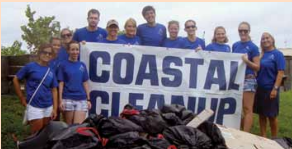
OC graduate students and trash

The NSU Oceanographic Center, National Coral Reef Institute, Guy Harvey Research Institute, Save Our Seas Shark Center, Broward County Sea Turtle Program, and International Game Fish Association provided information to our many volunteers. The OC graduate students fielded questions on all topics from our eager volunteers, making this another successful community venture. Congratulations to all that worked on this project, and we look forward to next year!