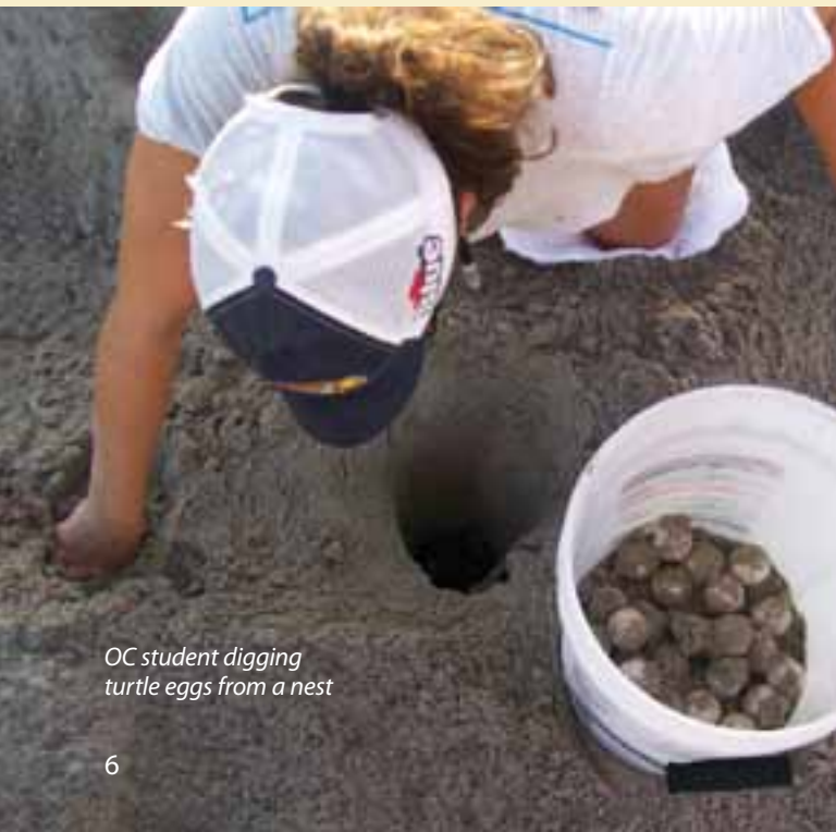
OC student digging turtle eggs from a nest