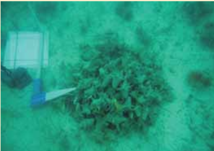
Queen Conch in St. Croix