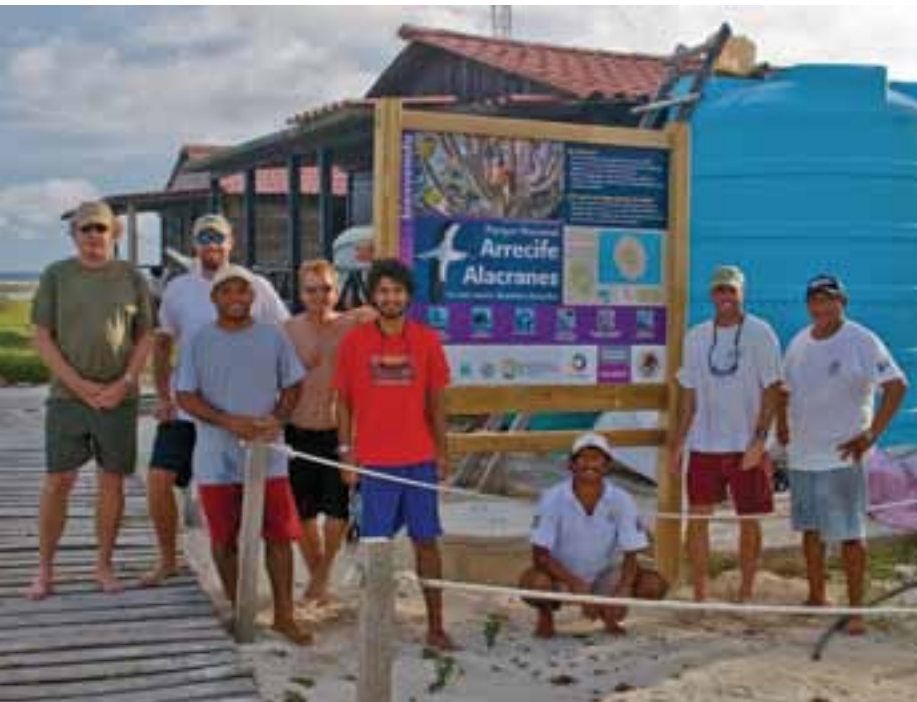
OC faculty and staff members and students with CONANP personnel

Scientific research on the vast, relatively remote system has been sparse, but is slowly growing. This reconnaissance trip gathered an overview of the reef's condition, as well as consideration of possible future research opportunities, discussion of future collaborative efforts, and strengthening of ties with local park personnel and officials. 🐠