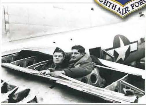
Inspecting the damage after their last mission