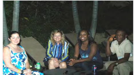
Fall RI Events