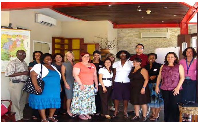
DCAR Global Course students providing CR Training in Suriname.