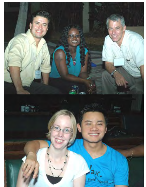
SHSS classmates at SHSS events